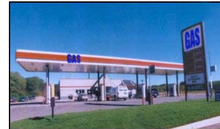
Brown's Gas Station Regular Gas $1.58 gal.