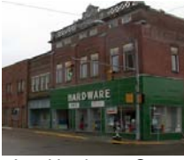
Ace Hardware Store All hammers and saws on sale