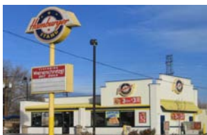
Hamburger Stand Regular hamburger $0.59