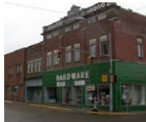
Hardware Store All hammers and saws on sale