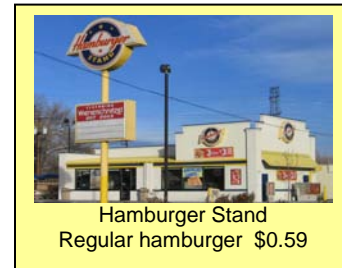
Hamburger Stand Regular hamburger $0.59