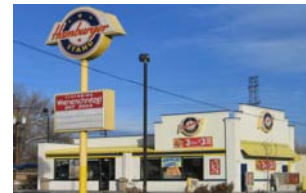
Hamburger Stand Regular hamburger $0.59