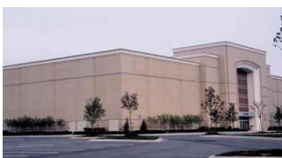
Department Store Men's shoe sale starts today