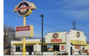
Hamburger Stand Regular hamburger $0.59