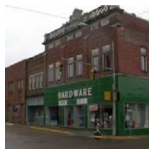
Hardware Store All hammers and saws on sale