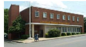
U.S. Post Office Buy your holiday stamps now