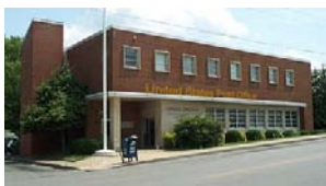
U.S. Post Office Buy your holiday stamps now