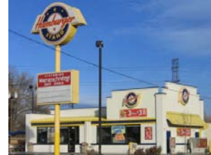
Hamburger Stand Regular hamburger $0.59