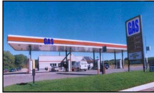
Brown's Gas Station Regular Gas $1.58 gal.