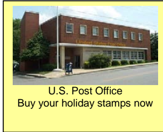
U.S. Post Office Buy your holiday stamps now