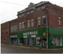
Ace Hardware Store All hammers and saws on sale