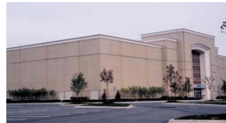
Department Store Men's shoe sale starts today