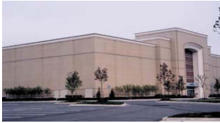
Department Store Men's shoe sale starts today