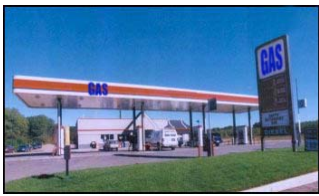
Brown's Gas Station Regular Gas $1.58 gal.