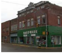
Ace Hardware Store All hammers and saws on sale