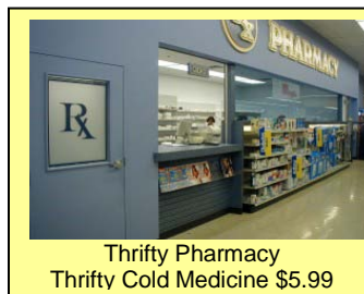
Thrifty Pharmacy Thrifty Cold Medicine $5.99