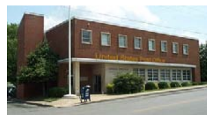
U.S. Post Office Buy your holiday stamps now