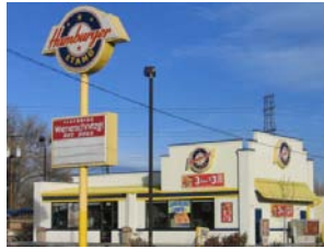
Hamburger Stand Regular hamburger $0.59