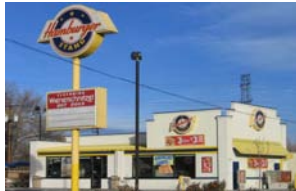
Hamburger Stand Regular hamburger $0.59