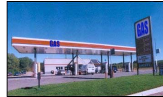
Brown's Gas Station Regular Gas $1.58 gal.