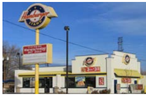
Hamburger Stand Regular hamburger $0.59