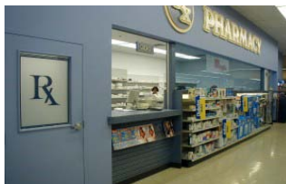
Thrifty Pharmacy Thrifty Cold Medicine $5.99