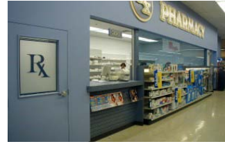
Thrifty Pharmacy Tylenol $3.99