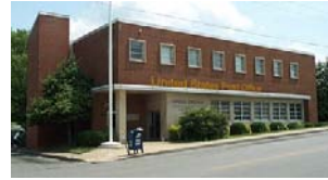
U.S. Post Office Buy your holiday stamps now