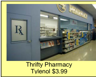
Thrifty Pharmacy Tylenol $3.99