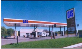
Brown's Gas Station Regular Gas $1.58 gal.