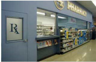
Thrifty Pharmacy Tylenol $3.99