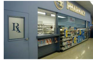
Thrifty Pharmacy Tylenol $3.99