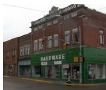
Hardware Store All hammers and saws on sale