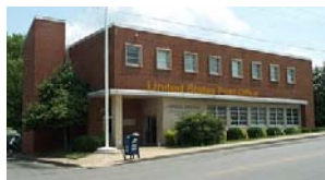
U.S. Post Office Buy your holiday stamps now