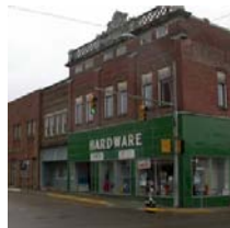
Hardware Store All hammers and saws on sale