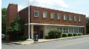
U.S. Post Office Buy your holiday stamps now