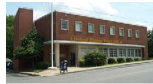
U.S. Post Office Buy your holiday stamps now