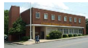
U.S. Post Office Buy your holiday stamps now