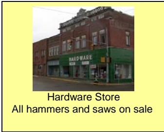
Hardware Store All hammers and saws on sale