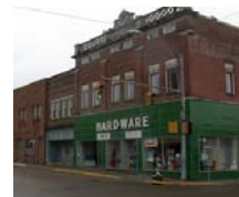
Hardware Store All hammers and saws on sale