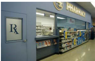
Thrifty Pharmacy Tylenol $3.99