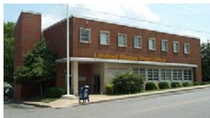
U.S. Post Office Buy your holiday stamps now